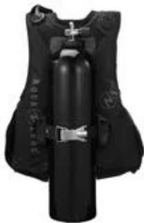
(AVAILABLE FOR WRAPTURE & NON-WRAPTURE BCD'S)

Increased fill rate; now one of the highest air flows in the industry. Environmentally sealed unit. Integrated hose clips attach to the hose. Cable activated rapid exhaust at the top, simply pull down on lower unit to dump air.