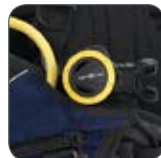
Octo-pocket and Octo D-ring