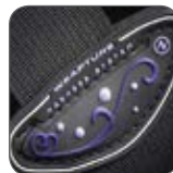
Wrapture Harness System