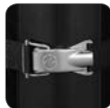
GripLock™ Tank Band