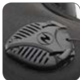
Flat e-valve Technology