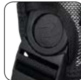
Swivel shoulder buckles