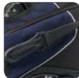
Knife Attachment Points