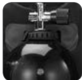
Valve Retention Strap