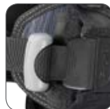
SureLock™ II Weight System